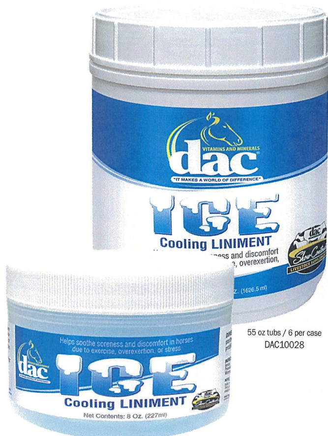
55 oz tubs / 6 per case DAC10028

Arnica Extract Thymol Magnesium Chloride Hexahydrate Glycerin Ginger Extract Geranium Extract Calendula Extract Echinacea Extract Wormwood Extract Comfrey Extract Chamomile Extract Rosemary Extract Tea Tree Oil